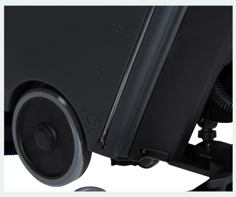
Built-in water level indicator.