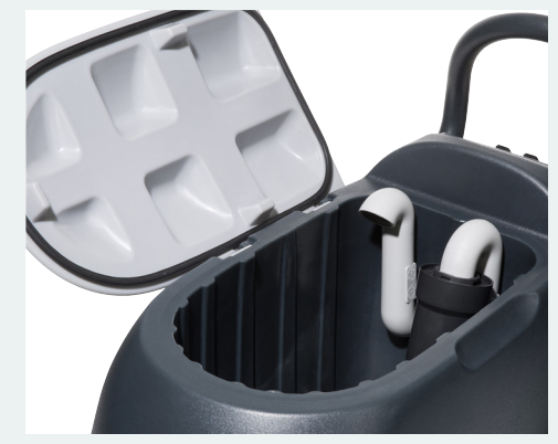
Large recovery tank and removable lid make it easy for you to clean and maintain the equipment. Fast and hygienic.

Specifications and details are subject to change without prior notice.